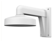
DS-1272ZJ-110-TRS Wall Mounting Bracket